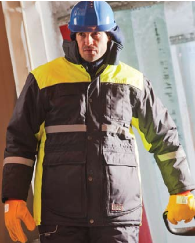
Cold Store Jacket – Navy and Yellow