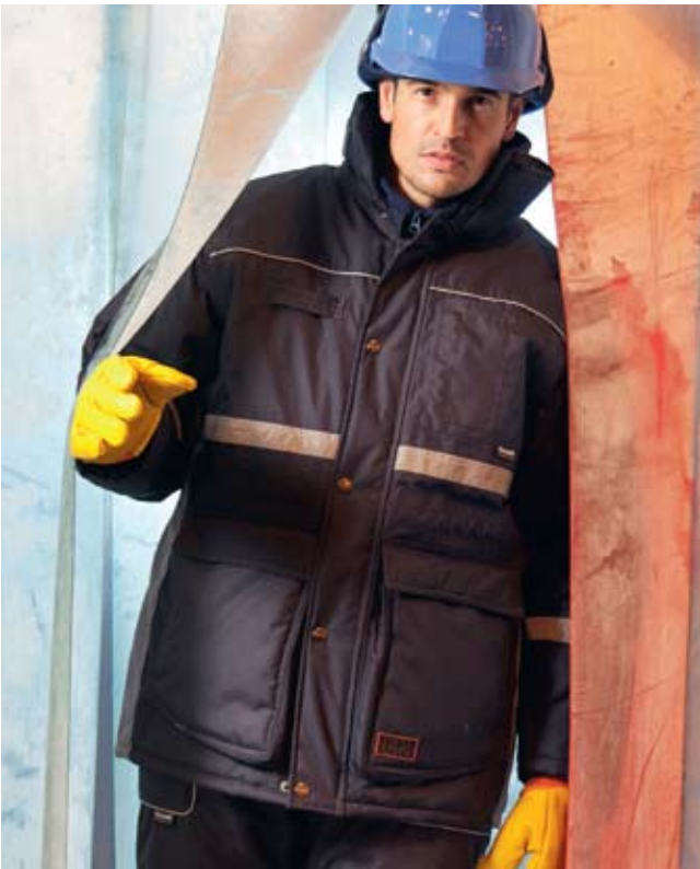
Cold Store Jacket – Navy and Grey